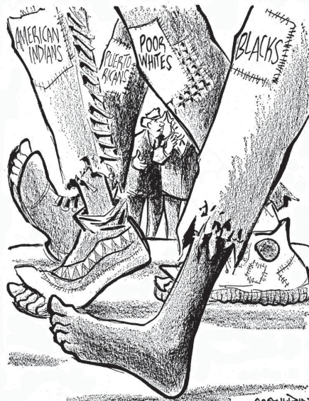
"What worries me, senator, is that they're getting into step." (political cartoon from 50 years ago)