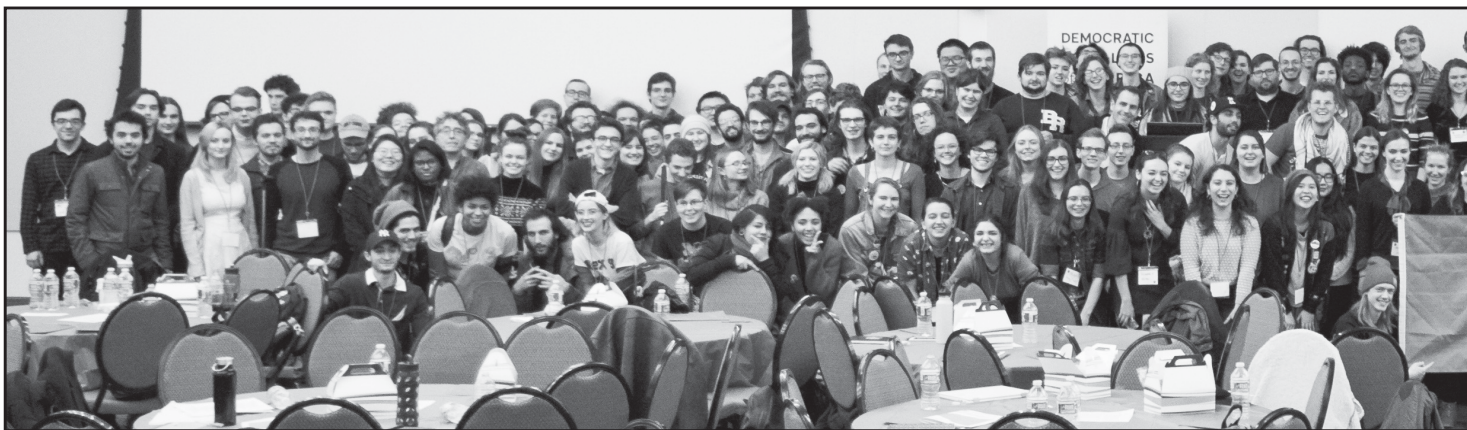
Some 350 people attended the Young Democratic Socialists Conference on February 16-18 in Washington, DC. And on February 22, the vice president of the National Rifle Association warned the Conservative Political Action Conference that "there are now over 100 chapters of Young