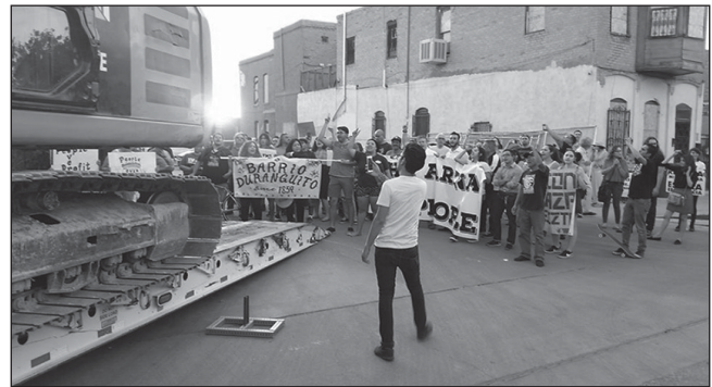
Community protest to save the Duranguito neighborhood on September 11, 2017, the day before the illegal demolitions.

El Chuco del Norte DSA (El Paso) has become key to a community effort to protect a neighborhood