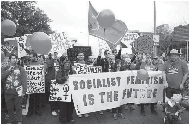
North Texas DSA at the Dallas women's march, January 2018.

In short, we've created a society whose existence relies on women to perform individualized domestic duties that keep families safe and secure while making them less valuable to employers. Rather than correcting this problem, the U.S. system doubles down: by privatizing nearly all basic needs, we ensure that those valued least by capitalism also lead the least dignified lives under it. We distribute too much financial burden for healthcare onto the people who use it.