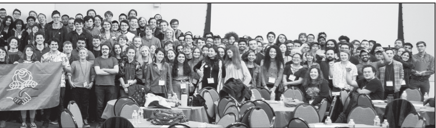
Democratic Socialists of America at many universities. . .