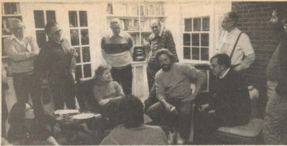
LIPC sixth annual Welcome to the New Year party.