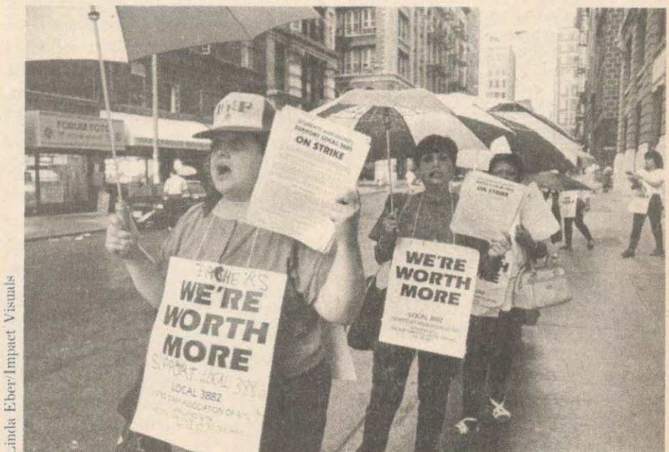
Clerical workers went on strike at New York University, in demand of better wages.