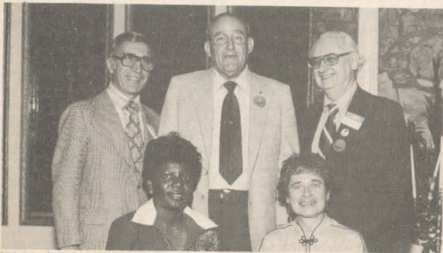
1979 founding meeting of the LIPC.