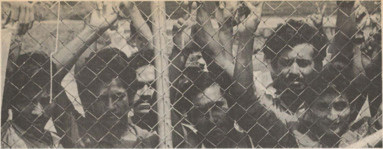
Striking workers occupy a textile factory in El Salvador.

that seceded from the party, and coincided with some process of unification of the Mexican left after the dissolution of the Communist Party in Mexico and other left forces. All of these elements coincided and resulted in the formation of a political party that saw as its most important task the democratization of Mexico. In this case, obviously not only the state, doing away with the one-party corporatist rule, but also