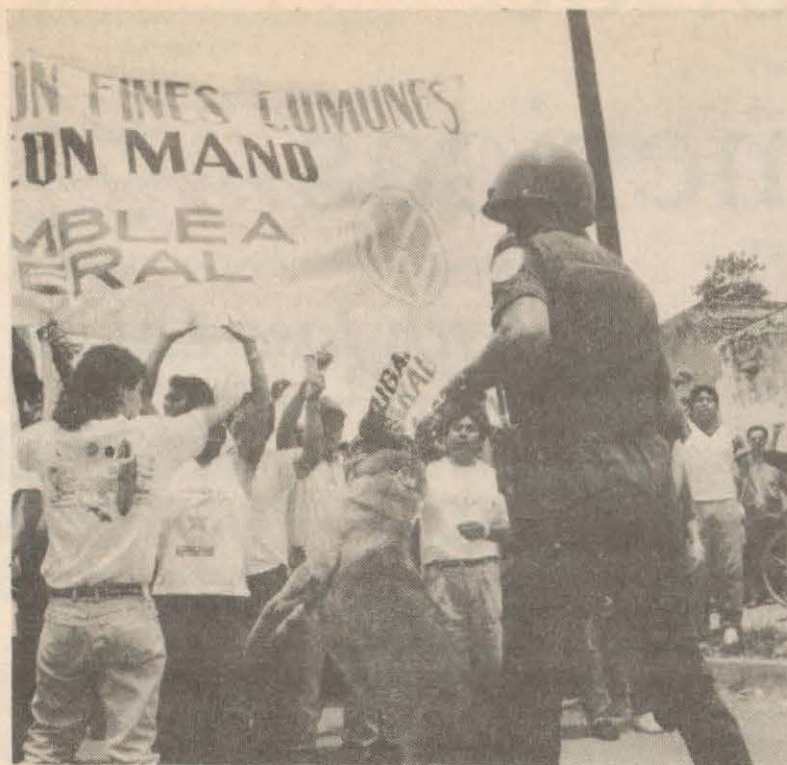
August 1993: Anti-riot police confront striking workers at a VW plant in Mexico.

For instance, if environmental rights and regulations are being downgraded in any of the three countries in order for one of the countries to become "more competitive" at the expense of people, then somehow we're going to have to denounce that, to expose it. But we must also offer our own alternative vision of what it would mean to protect the environment in the three nations. We're going to have to engage men and women in Mexico and Canada because the fact is that our economies are integrated. We also have to reach out to men and women in those other countries to make sure that we've got a common view and a common strategy.