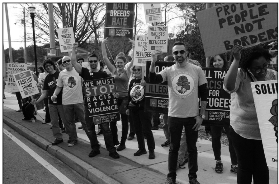
Metro Atlanta DSA at a welcoming refugees rally.

But until Syrian bodies started washing up on Europe's shores, much of the left in the United States hesitated even to talk about Syria, despite its being the single most prominent source of refugees and internally displaced people (combined) in the world and site of the bloodiest conflict of this century. For perspective, relative to the Syrian population, the refugees and internally displaced people are the equivalent of 135 million people either fleeing the United States or moving internally. Still, organizing around Syrian solidarity work has been largely restricted to those within the affected diaspora communities. Laila Abdelaziz from the Florida Council on American-Islamic Relations (CAIR) attributes this partially to the hesitancy of refugee resettlement and advocacy groups to take on thorny political issues. "Many refugee-support NGOs [in