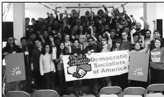
YDS members gathered in New York City February 12-14 for their annual winter conference.