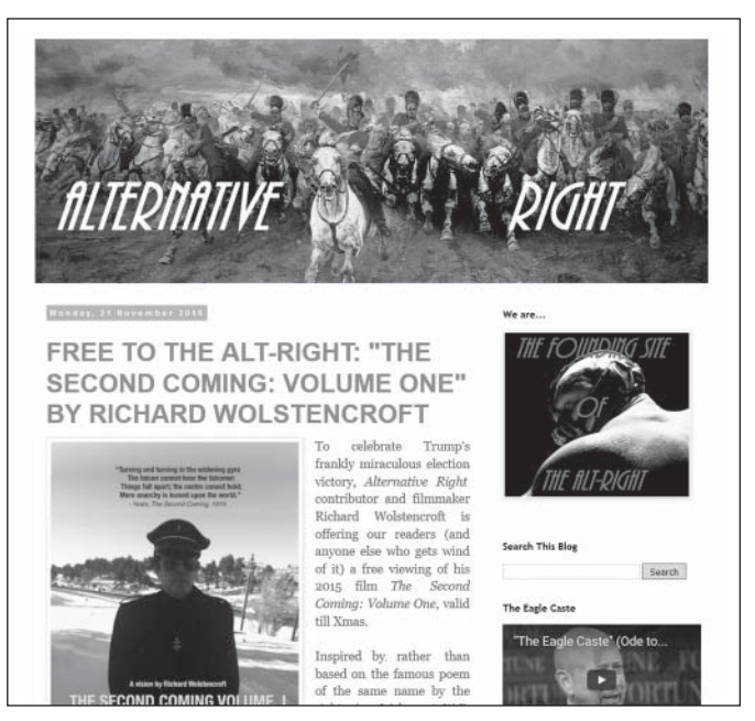
Portion of an "Alt-Right" website homepage.

scorn "elites," including Wall Street and the Beltway regulars of the GOP, while scapegoating immigrants, Muslims, and the less powerful. The Trump supporter chanting "Jew-S-A" to the corralled press corps at an Arizona rally reflected corrosive anti-Semitic attacks on the news media, suggesting they can't be trusted because they are controlled by a Jewish cabal. Among populists left and right there is a widespread loathing of smug insiders of both major parties who craft trade deals that destroy living-wage jobs and ignore the growing fear of those in the middle that they too will tumble into the economic abyss. "The Great Risk Shift" described by political scientist Jacob Hacker, with corporations and government cutting safety nets and shifting the risks of the economy on to individuals, has only gotten worse with the gig economy.