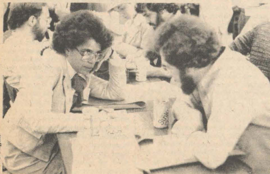
On the convention floor, delegates huddled to discuss strategy, studied documents, and conferred on points of order.

now I consider our relative harmony to be a sign of our growth (as an organization) and our experience (as a collection of activists). We are growing so fast that any factional lines would have to be redrawn almost weekly. And we're experienced enough to be able to put internal differences in perspective. No one resolution, amendment, or candidate is as important as the commitment that unites us.