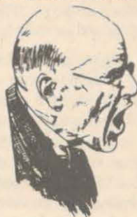
Eugene V. Debs

Belief in "manhood" could lead white, male, native-born skilled workers to identify with the values and political perspective of their employers and local elites; it could lead them to define their interests in opposition to blacks, women, immigrants and unskilled workers; the term itself is jarring to contemporary political sensibilities. But this concern with manhood could lead workers to embrace radical as well as conservative political goals. Citizen and Socialist is as much a social and economic history of late 19th century America as it is the biography of one individual of that era: Salvatore shows how employers whittled away the independence that skilled workers were accustomed to enjoying in the workplace, while large corporations increasingly dominated political decision-making. In Terre Haute, as elsewhere, workers' sense of self-worth, as producers and as citizens, was under assault: in this context, the defense of manhood "had a Janus-faced quality...[it] could either fuel opposition to industrial capitalism or ease such a transition to the new social order."