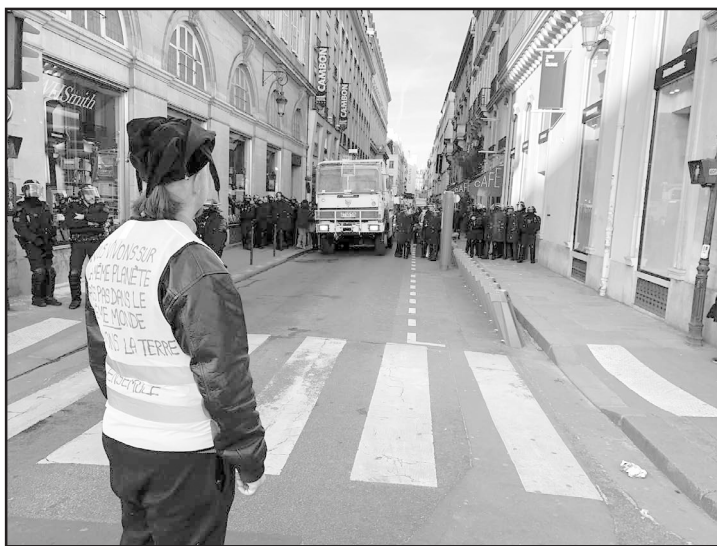
A gilets jaunes demonstrator waits at the end point of a solidarity march in Paris led by unionists on February 5, 2019. The back of the vest reads, “We live on the same planet, but not in the same world. Let's save the earth together.”