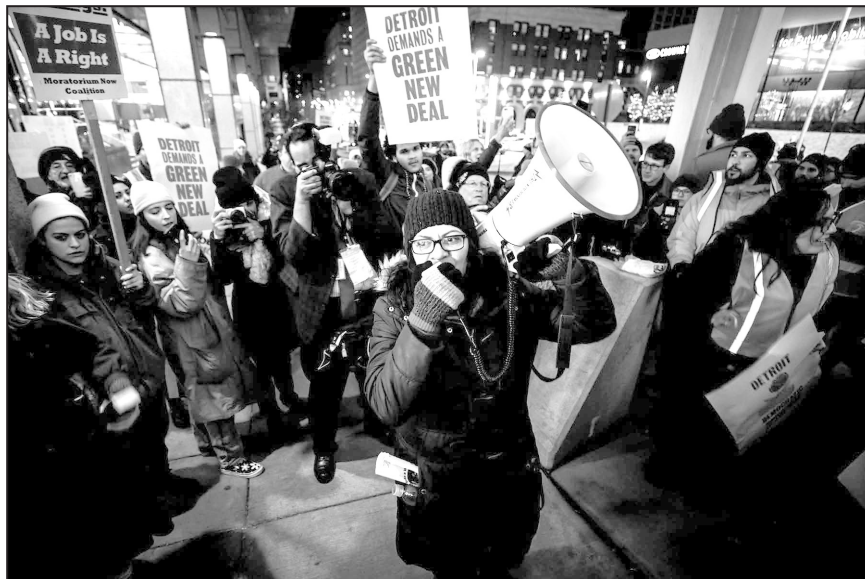
U.S. Congresswoman and DSA member Rashida Tlaib protests to stop the GM plant closings and re-tool the factories for green manufacturing.

As elites in tuxedos and cocktail dresses attempted to enter the gala (without making eye contact),