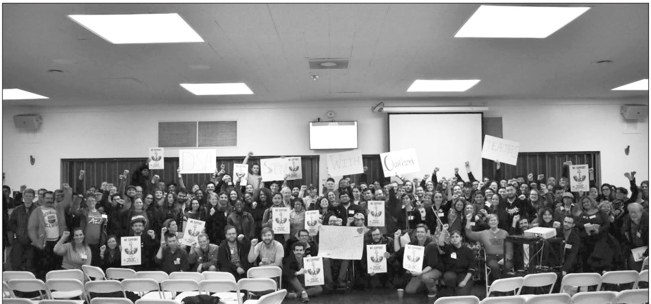
The first regional conference drew DSAers from California and Hawaii to meet each other, share information, and prepare for the national convention.