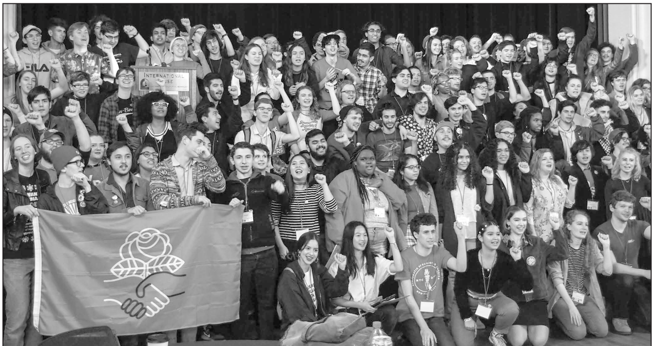
The Winter YDSA conference drew hundreds of young people from across the country.

The Camp Fire and its aftermath show the stark future that faces a world hurtling toward uncontrollable climate change: vast destruction and millions in Northern California choking on some of the most toxic air in the world. And even after the fire was contained, the impacts kept accumulating. The Pan-