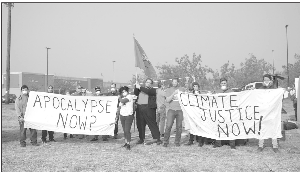
Chico DSA, North Valley Mutual Aid, and other local activists gather at the Walmart parking lot fire refugee camp.