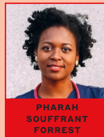
PHARAH SOUFFRANT FORREST